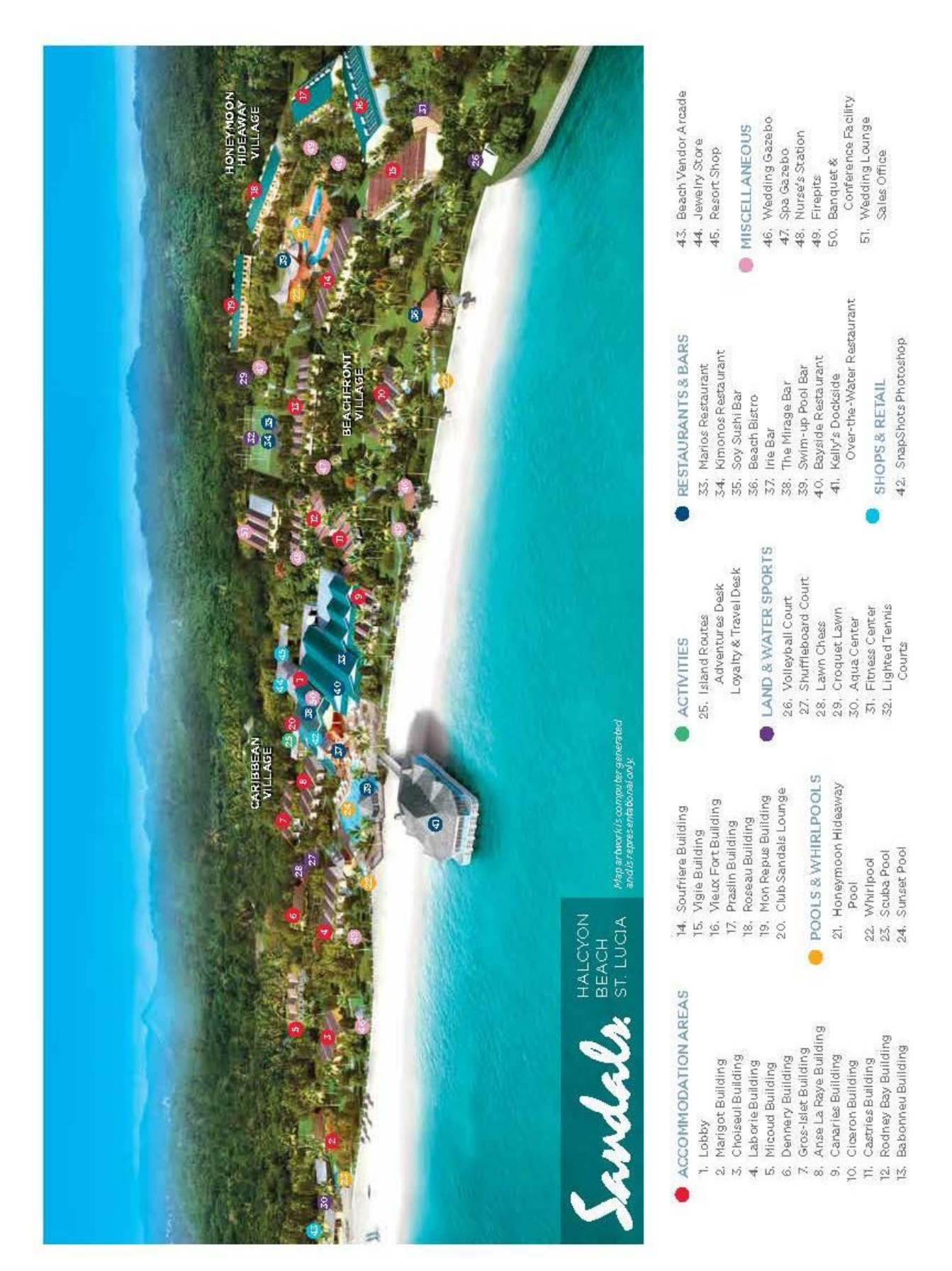
Subject to change without notice